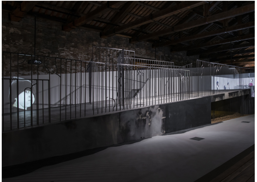
İnci Eviner, We, Elsewhere , 2019, mixed media installation with architectural elements, video, drawing, metal, ceramic and sound, installation view in the Pavilion of Turkey at the 58th Venice Biennale, 2019

viewer as well as one of the actors held the political potential of the work to offer an understanding of a 'we' in our contemporary condition that is not immediately exclusive by its nature. Presented as part of an international exhibition, the work also gained even greater resonance in a global context, in which we constantly negotiate our position as a participant in a community and as an 'other' at the same time.