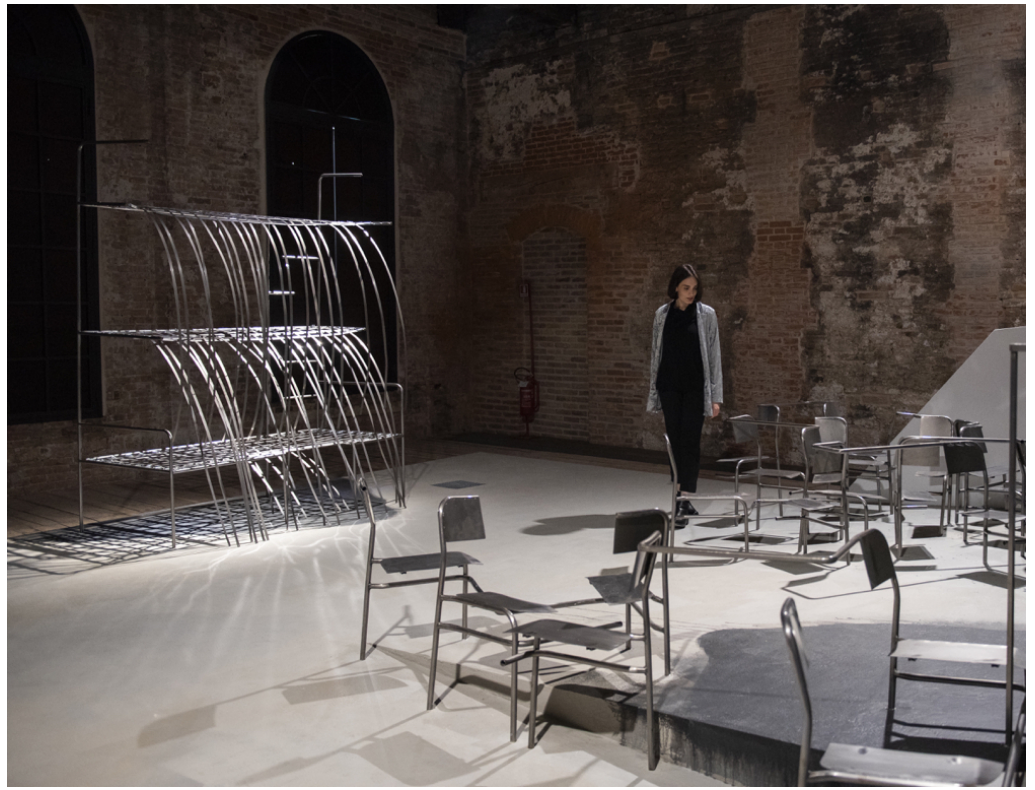
İnci Eviner, We, Elsewhere , 2019, mixed media installation with architectural elements, video, drawing, metal, ceramic and sound, installation view in the Pavilion of Turkey at the 58th Venice Biennale, 2019