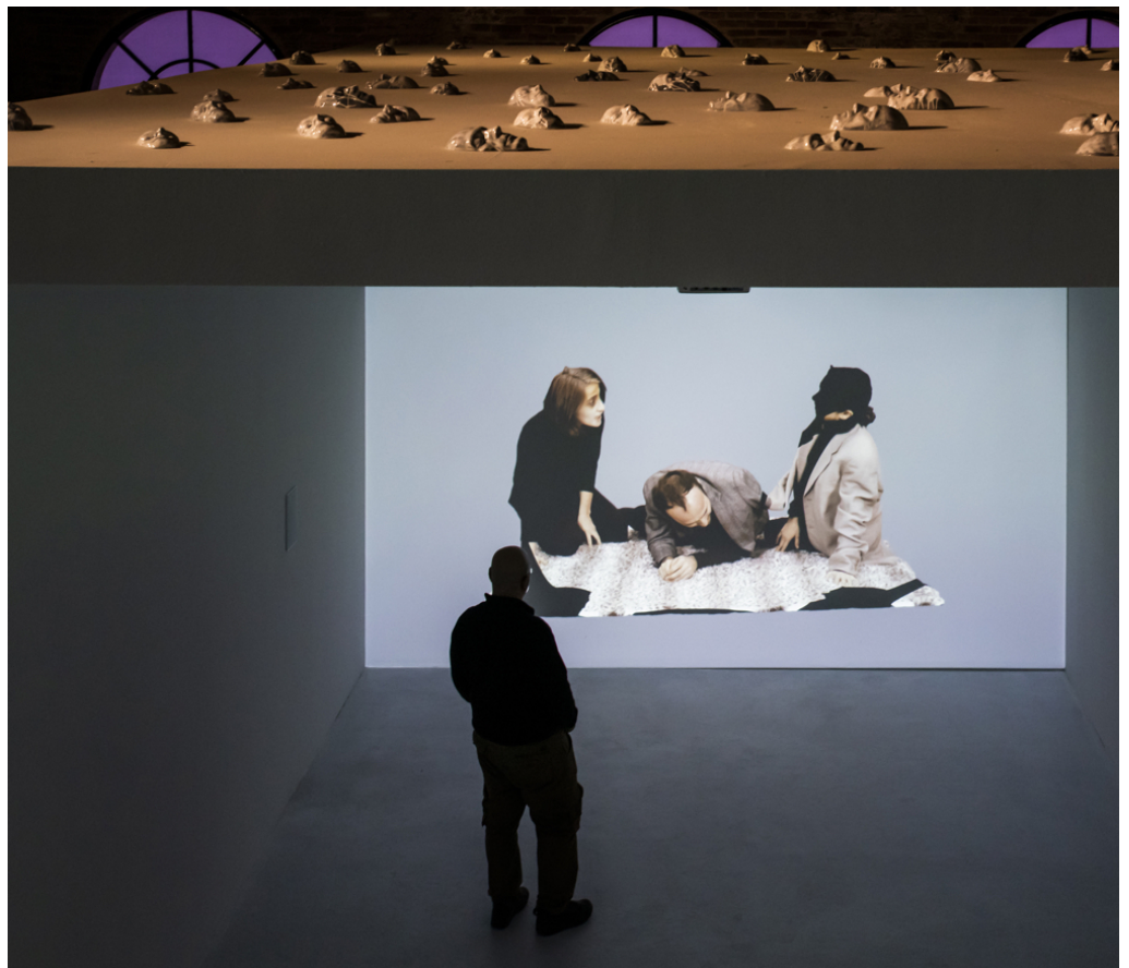
İnci Eviner, We, Elsewhere , 2019, mixed media installation with architectural elements, video, drawing, metal, ceramic and sound, installation view in the Pavilion of Turkey at the 58th Venice Biennale, 2019

The setting that Eviner created offered a suspended space for her characters and for the audience. The space seemed to be due for a change and transformation, yet the control mechanisms that had been operating continued to be limiting. Among the remains of institutional fixtures, there was still the memory of times that had shaped relationships within the community for so long. The characters that remained underground until then were now dealing with such memory, as well as with other individual memories to engage with each other, almost trying to find a new language and a means of bodily communication. It is only by finding that again that these characters would start to become subjects and form a new community. As such, the stage in the exhibition was thus a space of suspended history, and the figures and the audience were there to perform, to create a communal time, 'our time'.