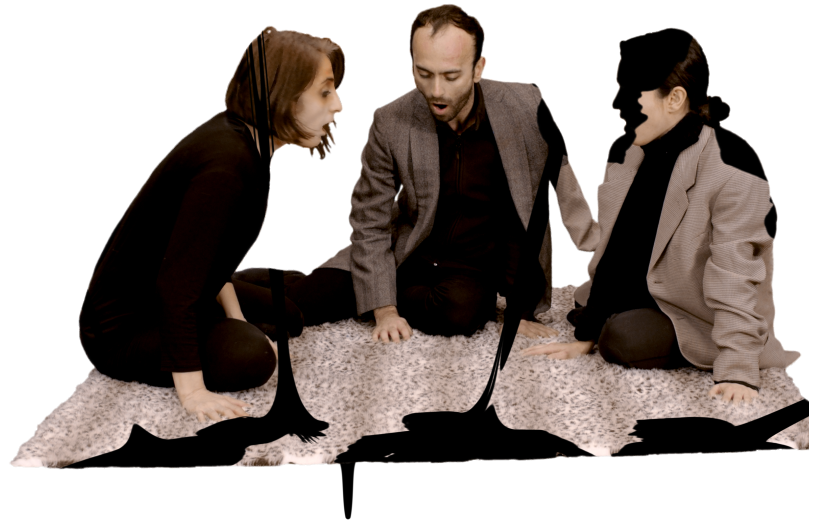
İnci Eviner, video still from We, Elsewhere , 2019, courtesy of the artist

What we are experiencing globally is a suspension between the previous narratives of history and the infinite development of time; the idea of time as a flow. In an era of global warming, and with all the catastrophes now deriving from human intervention in nature, along with a lack of willingness to take action due to the conflicts of interest in the global economy and politics, it is as if what is happening now is beyond graspable through past historical narratives. It is also beyond representable, as 'History no longer presents or represents any history, any idea of history .' [16]