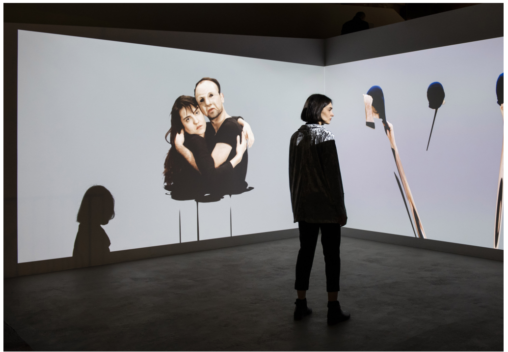
İnci Eviner, We, Elsewhere , 2019, mixed media installation with architectural elements, video, drawing, metal, ceramic and sound, installation view in the Pavilion of Turkey at the 58th Venice Biennale, 2019; photo by Poyraz Tütüncü, courtesy of IKS

Yet, there is a disjuncture that continuously disrupts such a notion of a community: there is also the 'Elsewhere' – which suggests another experience in another place, or the place and state of a displaced other. This relates to another drama, a drama that had been going on at the border between Turkey and Greece and which had escalated, with the Turkish government deciding to let all refugees pass through its border to Europe after the killing of its soldiers in İdlib. Just a month before the COVID-19 outbreak, the issue of refugees was the top subject in both the Turkish and the international news until it was interrupted by the news of the pandemic. While the movement of people was put on hold for several months due to the travel limitations, the people actually on the move, the refugees, the displaced and marginal groups, have continued to struggle for survival in invisible ways. And as questions about ongoing conflicts, borders, international politics, and how to act in local and global solidarity, continue to wait for urgent answers, the consequences of mass displacement and the issues of refugees and immigrants have remained in the background.