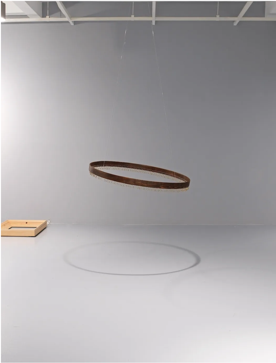
Cevdet Erek, Larger Daf Without Skin II , 2023, pine wood, metal, 2 × 40 1/8".

Sound, measurement, and time lie at the heart of Cevdet Erek's experiential practice. His installations feature rulers, speakers, frame drums, and carpets repurposed to augment the viewer's perception of and interactions with space. In his first gallery show in Istanbul, Erek experiments with the formal, audible, and conceptual possibilities of a small group of objects.